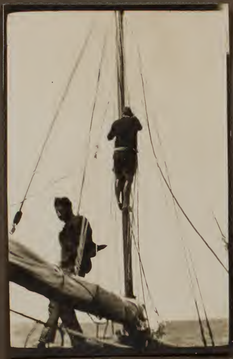
C. Vedgen (up mast) Paul